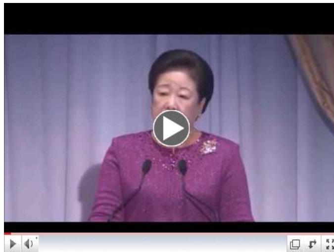
Hak Ja Han- The Forgotten True Father

Watching Mother Han's speech on October 15 in Kanagawa led me to consider giving her a prize for how many speeches she can give where she does not mention True Father even once. As in previous speeches given this year, she describes how Heaven sent the UN forces to Korea so that the Only Begotten Daughter, 7 years old at the time, could escape to the south. I guess Heaven was too busy to be concerned about Sun Myung Moon who was in the Hungnam Death Camp at the time?