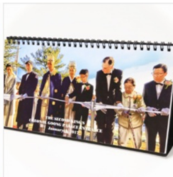
2017 Desk Calendar $20.00