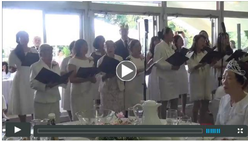
Cosmic Perfection Blessing and Holy Marriage of True Parents of Heaven, Earth and Humanity, Banquet Entertainment

Sign up for Fall, 2017 Holy Spirit University Classes!