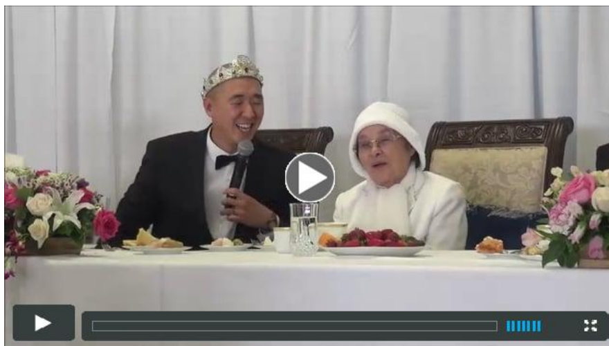
Cosmic Perfection Blessing and Holy Marriage of True Parents of Heaven, Earth and Humanity, The King's speech.