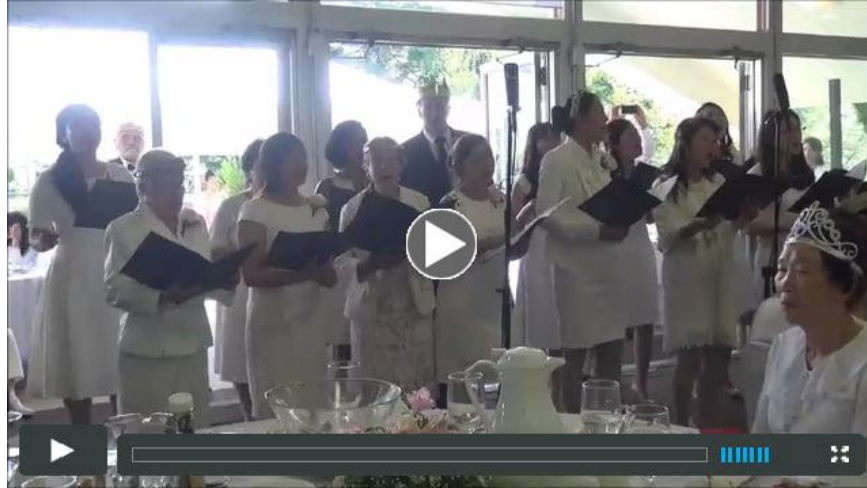
Cosmic Perfection Blessing and Holy Marriage of True Parents of Heaven, Earth and Humanity, Banquet Entertainment

Sign up for Fall, 2017 Holy Spirit University Classes!