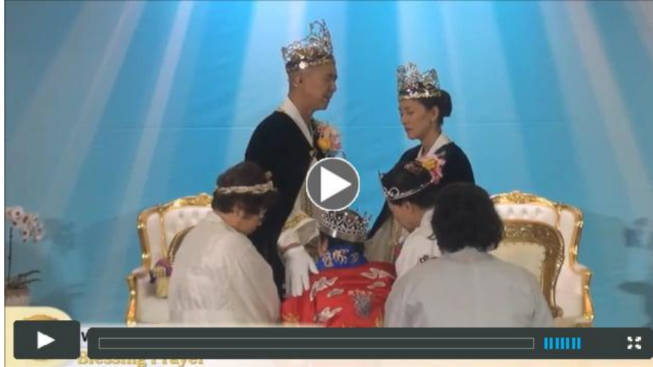
Cosmic Perfection Blessing and Holy Marriage of True Parents of Heaven, Earth and Humanity, Sanctuary Church, September 23, 2017

True Mother Kang has a life story full of trials and victories of faith. Here is her testimony.