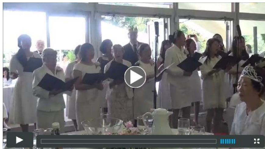
Cosmic Perfection Blessing and Holy Marriage of True Parents of Heaven, Earth and Humanity, Banquet Entertainment