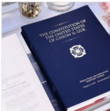
Cheon Il Guk Constitution