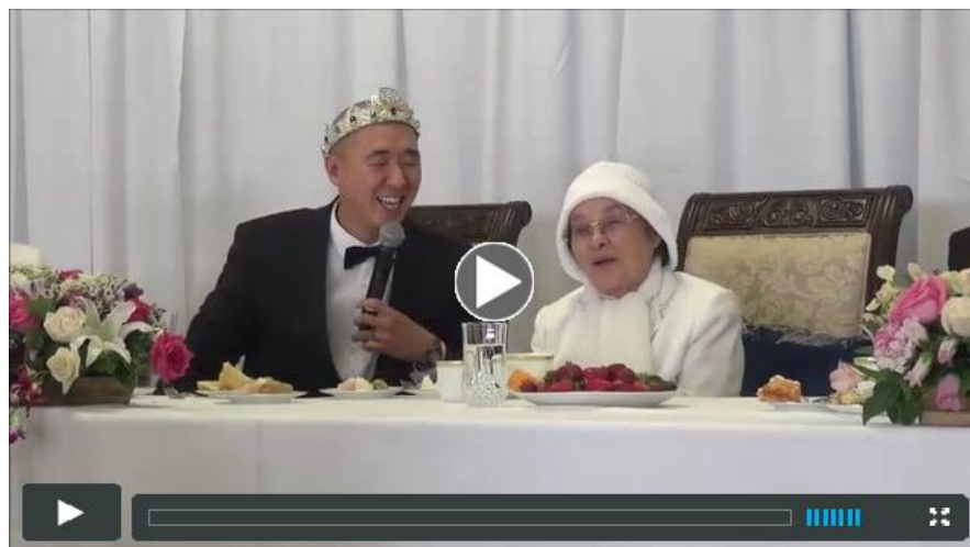
Cosmic Perfection Blessing and Holy Marriage of True Parents of Heaven, Earth and Humanity, The King's speech.