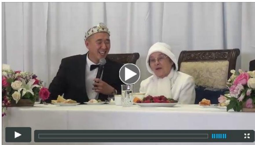
Cosmic Perfection Blessing and Holy Marriage of True Parents of Heaven, Earth and Humanity, The King's speech.