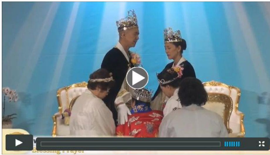
Cosmic Perfection Blessing and Holy Marriage of True Parents of Heaven, Earth and Humanity, Sanctuary Church, September 23, 2017

True Mother Kang has a life story full of trials and victories of faith. Here is her testimony.