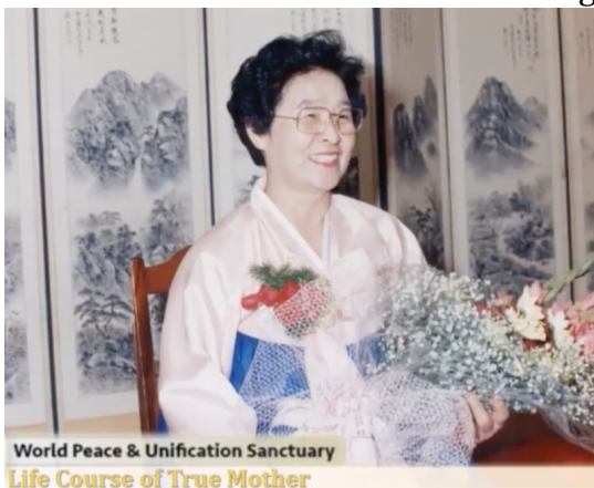
World Peace & Unification Sanctuary Life Course of True Mother