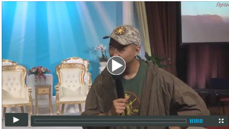
Sunday Service - September 24, 2017 - Rev. Hyung Jin Moon - Unification Sanctuary, Newfoundland PA