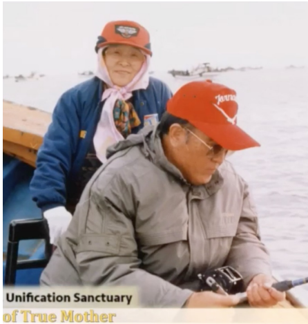
Unification Sanctuary of True Mother

He replied to him, "Who is my mother, and who are my brothers?" Pointing to his disciples, he said, "Here are my mother and my brothers. For whoever does the will of my Father in heaven is my brother and sister and mother." Matthew 12:48-50