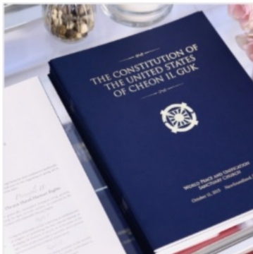
Cheon Il Guk Constitution