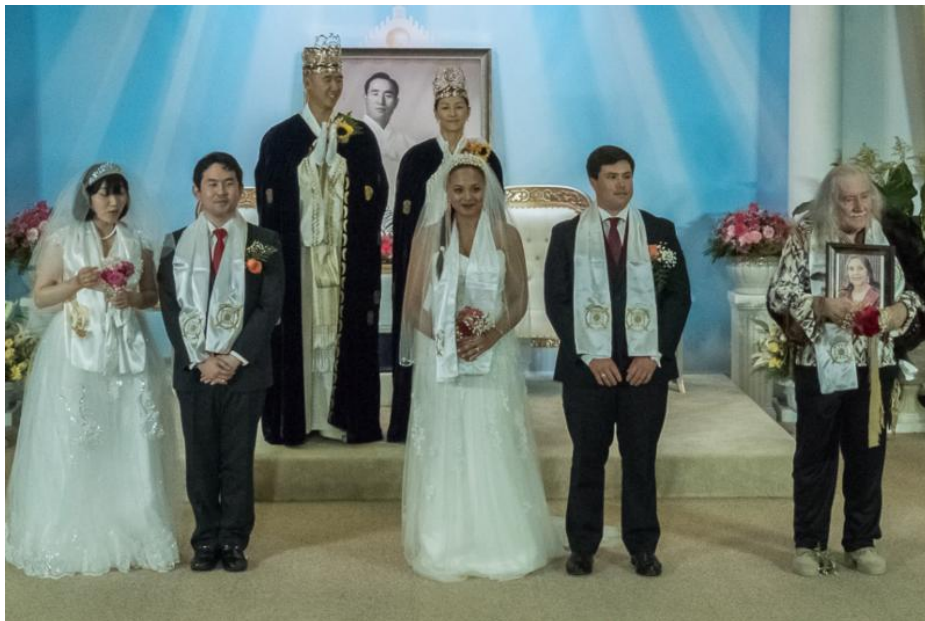
Cosmic Blessing of 4300 Couples 9.7.2017

On September 7, participants from all over the world gathered to participate in deeply moving ceremonies at the Unification Sanctuary in Newfoundland, PA to observe the second anniversary of Foundation Day, the fifth anniversary of True Father's 5th Anniversary and the Cosmic Blessing of 4300 Couples, Third Phase.