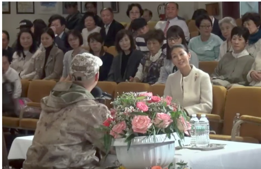
Q & A with the Second King, 9.7.2017