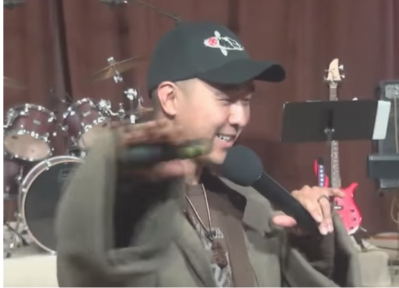
Unification Sanctuary Service 9/10/2017

The majority of Muslims are peaceful, but for those who are serious about Islam, the Koran does justify the use of violence against non-believers. Mohammed himself was a jihadi, who approved the beheading of 800 Jews of the Banu Qurayza tribe .