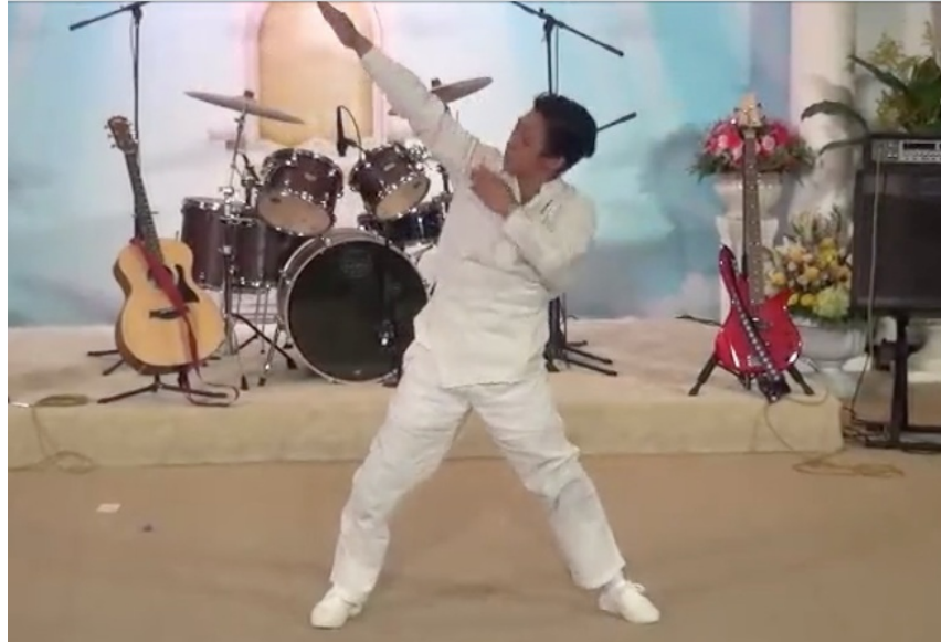
4300 Couple Cosmic Blessing Performances