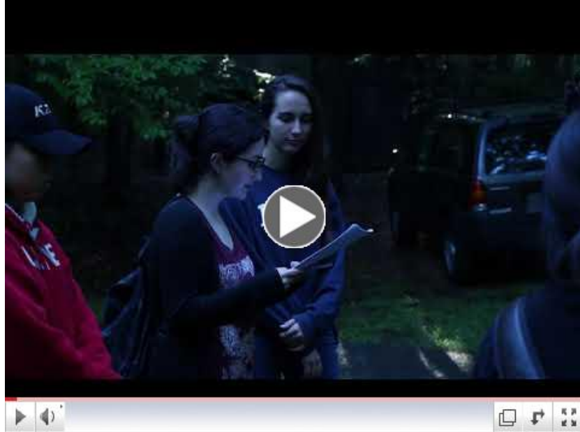
Sanctuary Family Summer Camp, August 13-20, 2017