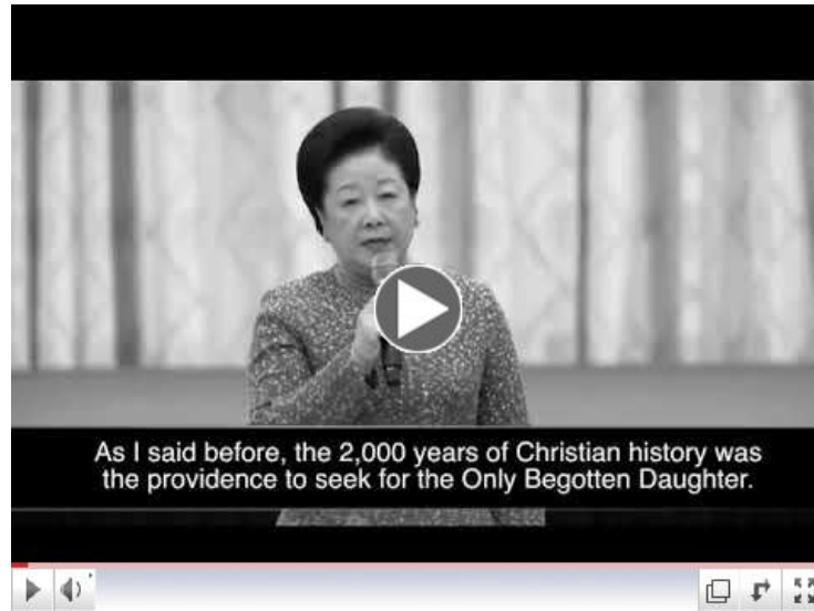
What is True Mother Currently Teaching?