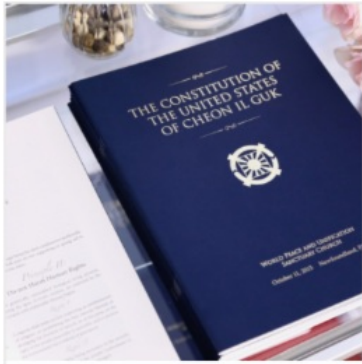
Cheon Il Guk Constitution