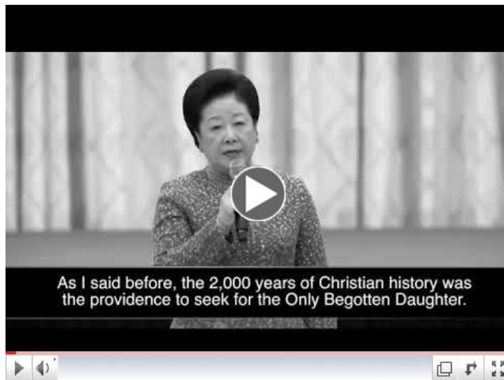
What is True Mother Currently Teaching?