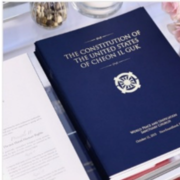
Cheon Il Guk Constitution