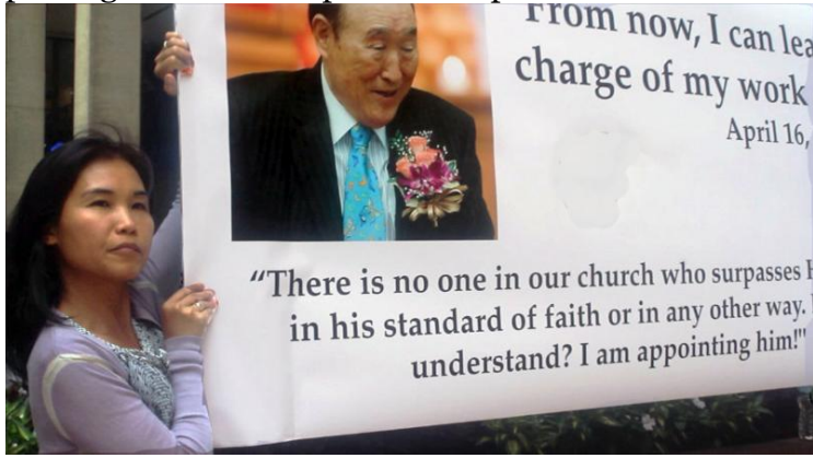
Rally to Return to Father's Authority outside MSG

passing and from his position as president of the church in America in early 2013?