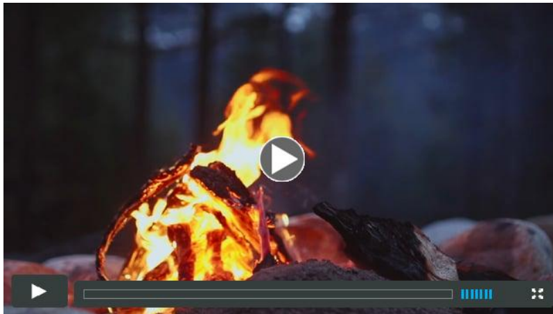
Ancestor Liberation for the Victims of Democide