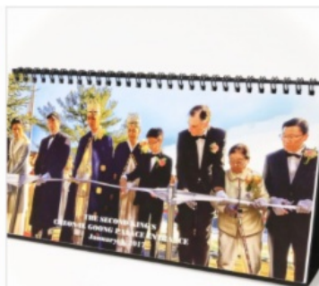
2017 Desk Calendar $20.00