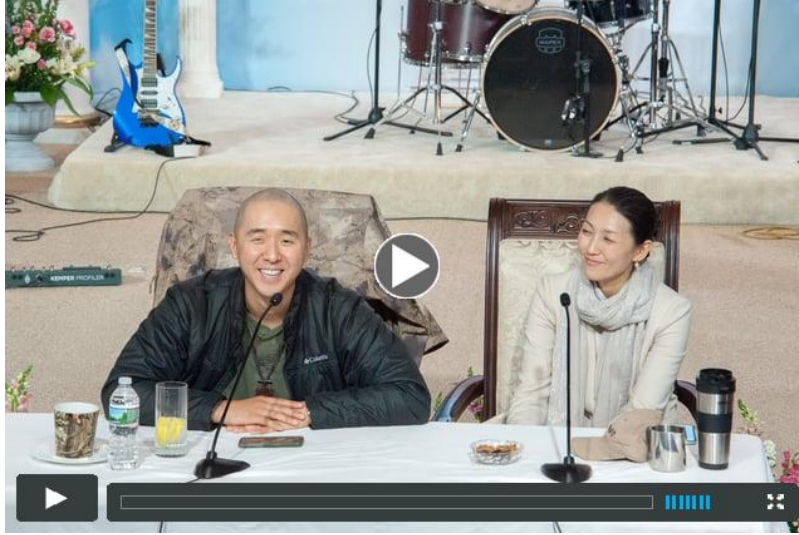
King and Queen's Q&A - May 26, 2017 - Unification Sanctuary, Newfoundland PA