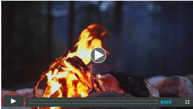
Ancestor Liberation for the Victims of Democide