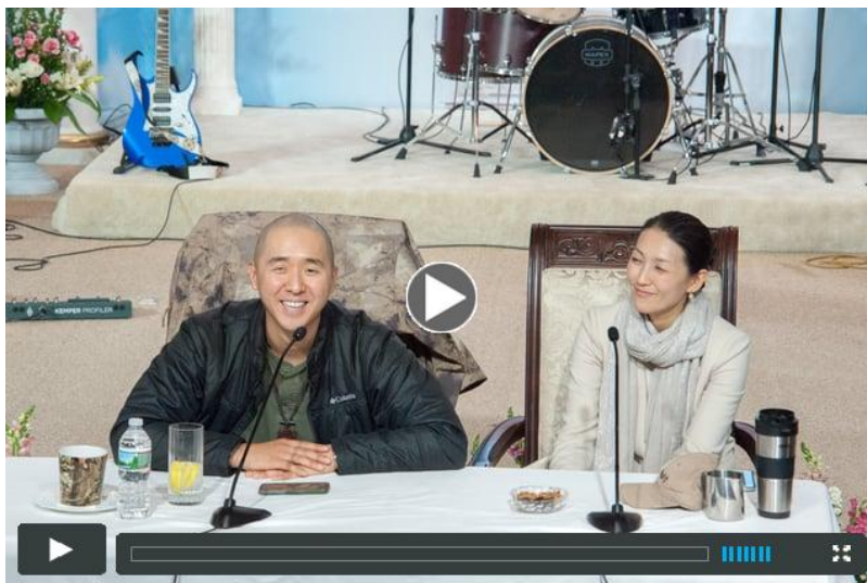
King and Queen's Q&A - May 26, 2017 - Unification Sanctuary, Newfoundland PA