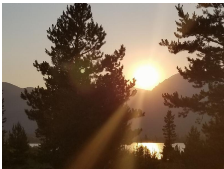
Sunrise in Rocky Mountains

What good is it, my brothers and sisters, if someone claims to have faith but has no deeds? Can such faith save them? Suppose a brother or a sister is without clothes and daily food. If one of you says to them, "Go in peace; keep warm and well fed," but does nothing about their physical needs, what good is it? In the same way, faith by itself, if it is not accompanied by action, is dead. But someone will say, "You have faith; I have deeds." Show me your faith without deeds, and I will show you my faith by my deeds. You believe that there is one God. Good! Even the demons believe that -and shudder. James 2:14-19