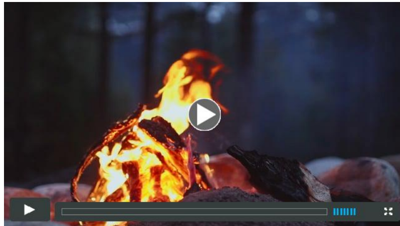
Ancestor Liberation for the Victims of Democide