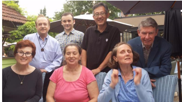
Sanctuarians from America, Poland, and Scotland