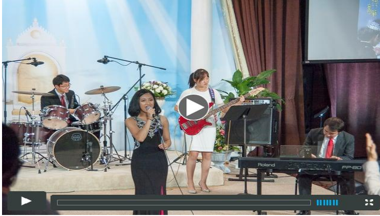
55th Day of True All Things Entertainment - May 26, 2017 - Unification Sanctuary - Newfoundland, PA