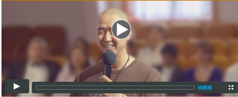
Kingdom Fellowworkers - May 28, 2017 - Rev. Hyung Jin Moon - Unification Sanctuary *****