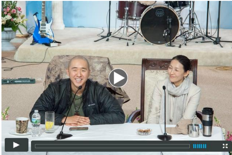
King and Queen's Q&A - May 26, 2017 - Unification Sanctuary, Newfoundland PA *****