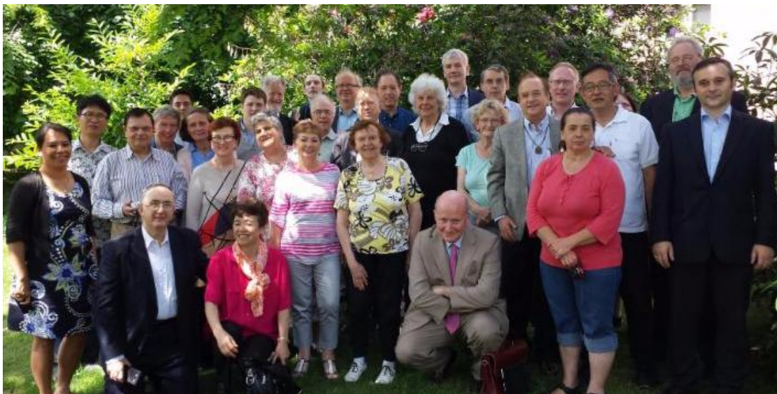
Participants at the Belgium Conference on "The Life and Legacy of Sun Myung Moon and the Unification Movements in Scholarly Perspective"