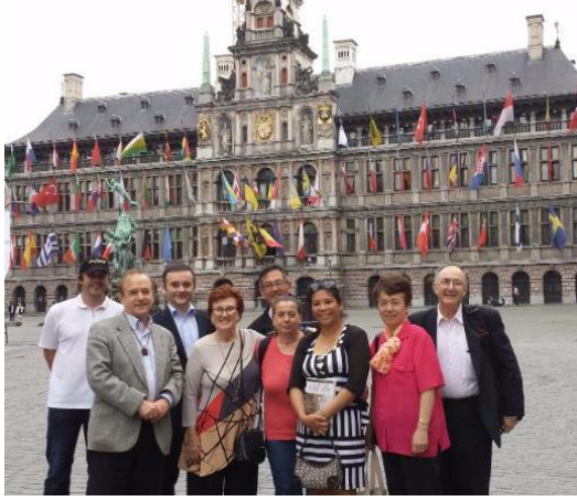
Sanctuarians from Germany, Italy, Poland and USA in front of Antwerp City Hall

Mother's motivations for declaring herself the Sinless Only Begotten Daughter is that relying on the authority of Rev. Moon would leave her vulnerable from others who fancy themselves more knowledgeable than she. One of the scholars present commented, "so she changed the theology in order to keep power."