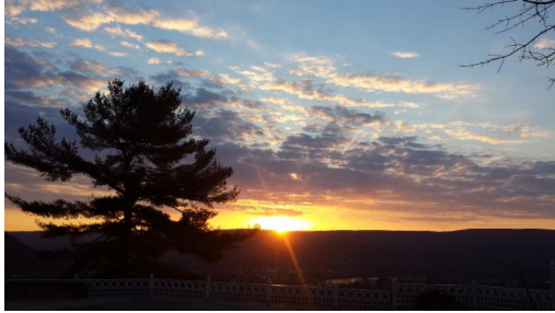
Sunrise at Cheon Il Gung Palace

Therefore be imitators of God, as beloved children. And walk in love, as Christ loved us and gave himself up for us, a fragrant offering and sacrifice to God. But fornication and all impurity or covetousness must not even be named among you, as is fitting among saints. Let there be no filthiness, nor silly talk, nor levity, which are not fitting; but instead let there be thanksgiving. Be sure of this, that no fornicator or impure man, or one who is covetous (that is, an idolater), has any inheritance in the kingdom of Christ and of God. Let no one deceive you with empty