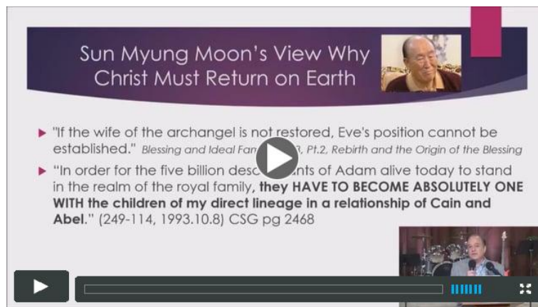
"Sinless Only Begotten Daughter" vs the "3 Generations Kingships"