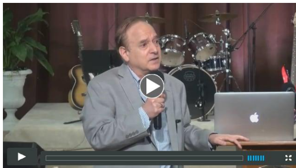
The Sinless Only Begotten Daughter vs. 3 Generations Kingship - May 7, 2017