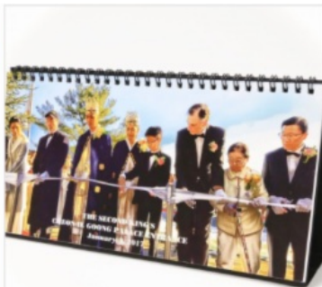
2017 Desk Calendar $20.00