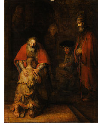
Rembrandt painting of the Prodigal Son