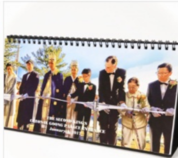
2017 Desk Calendar $20.00