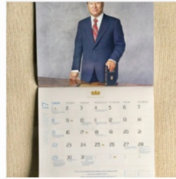
2017 Wall Calendar $25.00