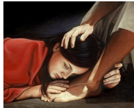
Jesus forgiving adulterous woman

and of the God who both judges AND forgives us, but it fits in well with the Sinless Only Begotten Daughter heresy, which is why no one dared to critique his unprincipled feminist rant.