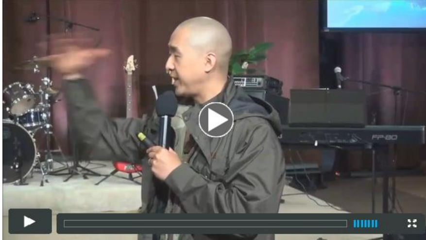
Kingdom Inheritor - April 30, 2017 Unification Sanctuary Service

He praised William Layne Craig , a leading Christian apologist who has challenged the leading atheists at top universities and showed a debate between Dr. Craig at Biola University debate with Christopher Hitchens , author of God Is Not Great: How Religion Poisons Everything . Craig presented a systematic overview of the cosmological, teleological, historical, moral, and experiential arguments for God. He pointed out that without God there is no absolute basis for morality. In response Hitchens asked "what moral action Christian believers could do that he, as an atheist, could not?"