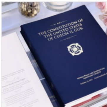
Cheon Il Guk Constitution