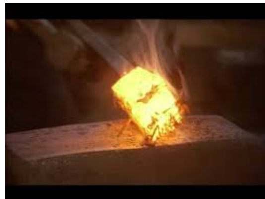
Forging of a Samurai Sword