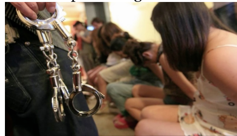
Girls exploited as Sex Slaves for N. Korean dictatorship

The alternative is to become weak and to allow an all-powerful government to do whatever it wishes. In North Korea, pretty girls in middle school are forced to join the Dancing and Singing department and the "Satisfaction Department," where they are trained to give sexual pleasure to the Supreme Leader, Kim Jong Un, other leaders or "special guests" at one of more than 30 "pleasure palaces." These exploited young women could have pursued their God-given ideals including entering not just respected cultural or scientific professions, but also the most honorable profession of being an honorable, powerful wife and mother.