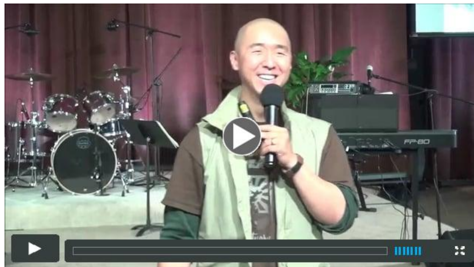
Entrance into the Kingdom - April 16, 2017 - Unification Sanctuary Sermon

Jesus had power over death through his resurrection. We must create a society where predators and bringers of death are afraid. Popular culture brainwashes us to think it's cool to be weak and unarmed. Jesus empowered us to challenge Satan spiritually. Now is the time for us to be able to challenge Satan physically as well. True Father met Jesus on Easter morning, beginning the development of his messianic self-consciousness.