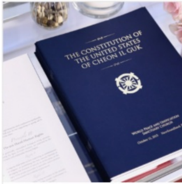
Cheon Il Guk Constitution