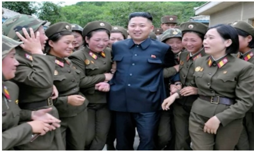
Kim Jong Un with Female Soldiers

produced air rifles and later the Vulcan cannon. He had seen people publicly hanged in North Korea. He was a leading developer of national defense industry. In contradiction with the Family Federation which is attempting to re-cast Father as a Catholic Jesus.