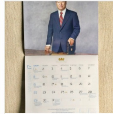
2017 Wall Calendar $25.00