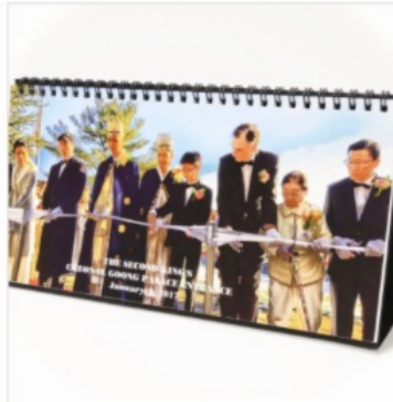
2017 Desk Calendar $20.00