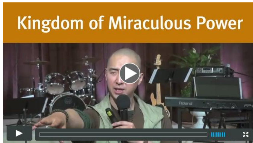
April 9, 2017 Unification Sanctuary Sermon, Rev. Hyung Jin Moon

The kingdom of God is not just in words, but in power, drawing on the "ruach" or invisible breath of God. Evil grows when good people are emasculated, do not stand up for what is right. Men must take up their responsibility as protectors, "sheep dogs" and "peace police" of their families, communities, nation and God's Kingdom.