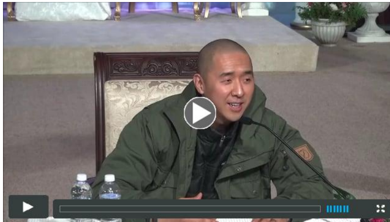
Q&A with Hyung Jin Nim, March 26, 2017