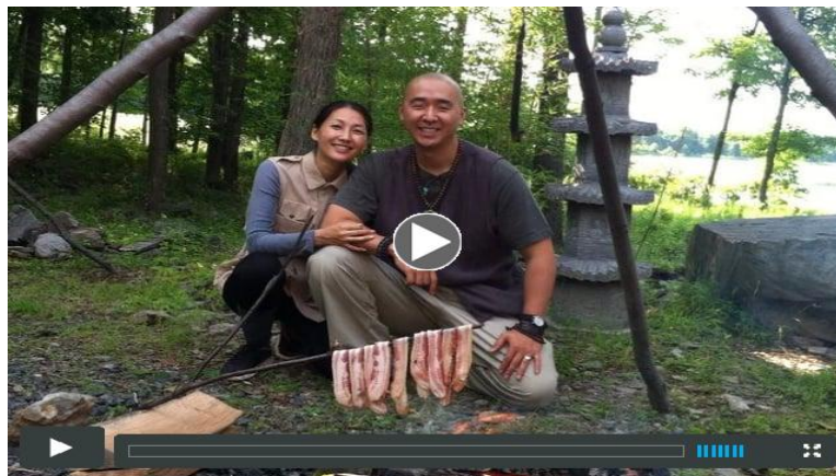
Hyung Jin Moon on Building a Successful Marriage