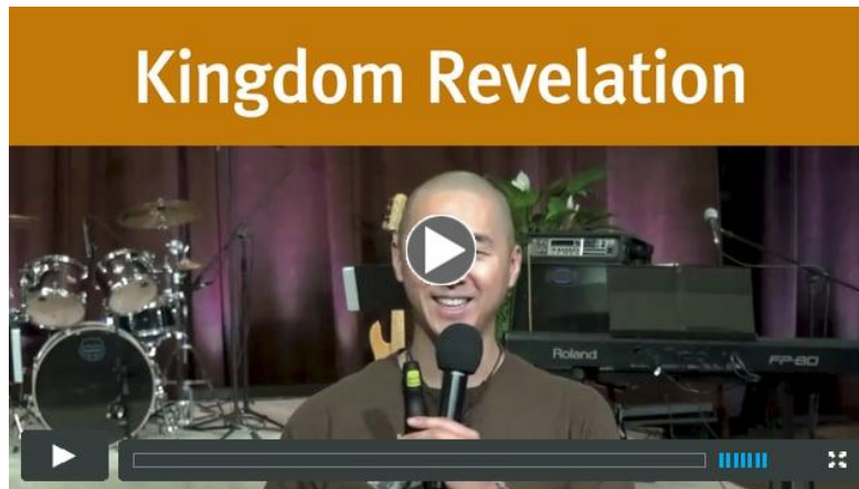
April 2, 2017 "Kingdom Revelation" Unification Sanctuary Service