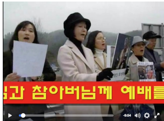
3/31/2017 Sanctuary Demonstration at Cheongpyeong

Even though Cheongpyeong and all the assets of the Unification Movement