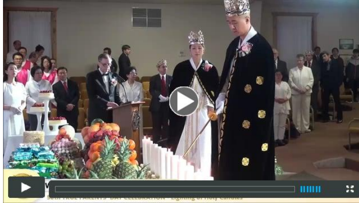
58th True Parents' Day, March 28, 2017