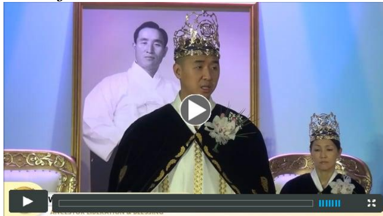
3.26.17 Ancestor Liberation and Blessing, Unification Sanctuary, Newfoundland PA

Satan has made it seem that the most dangerous threat to humanity is war, but it is undeniably evident that the greatest threat to peace, prosperity, and human flourishing is unrestrained political power and autocratic, centralized government. Political scientist R.J. Rummel is famous for noting, "Political mass murder grows increasingly common as political power becomes unconstrained. At the other end of the scale, where power is diffuse, checked, and balanced, political violence is a rarity. According to Rummel, "The more power a regime has, the more likely people will be killed. This is a major reason for promoting freedom." Rummel concludes that "concentrated political power is the most dangerous thing on earth."