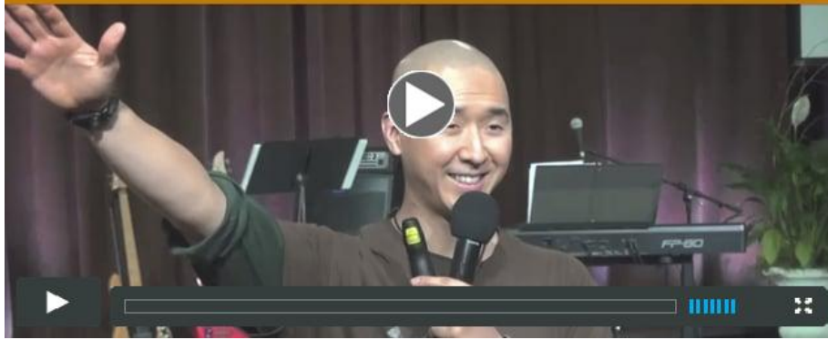
Kingdom Discernment - March 19, 2017

People of faith need to wake up to the plight of fellow believers who are being persecuted and murdered in the cults of satanic governments that exist in many parts of the world, and they need to be vigilant to make sure that such things do not become prevalent in the West, where we have usually benefited from constitutional protections against the abuse of government power. Unfortunately the safeguards the U.S. founders instituted have been eroded and threatened. Many young people in the U.S. and around the world increasingly seek more government power and control, not less.