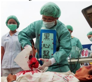
Organ Harvesting Enactment

In Sunday's service on Kingdom Discernment, Hyung Jin Nim explained why it's important to establish the peace police and the peace militia, giving the analogy that even though sheep dogs have common ancestors with wolves they don't kill the sheep, they protect them. The Bible declares that the lion will lay down with the lamb, protecting and empowering them and infusing his power into them so that they become more like him.