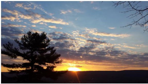
Sunrise at Cheon Il Goong Palace

One of the Pharisees asked him to eat with him, and he went into the Pharisee's house, and took his place at table. And behold, a woman of the city, who was a sinner, when she learned that he was at table in the Pharisee's house, brought an alabaster flask of ointment, and standing behind him at his feet, weeping, she began to wet his feet with her tears, and wiped them with the hair of her head, and kissed his feet, and anointed them with the ointment. Now when the Pharisee who had invited him saw it, he said to himself, "If this man were a prophet, he would