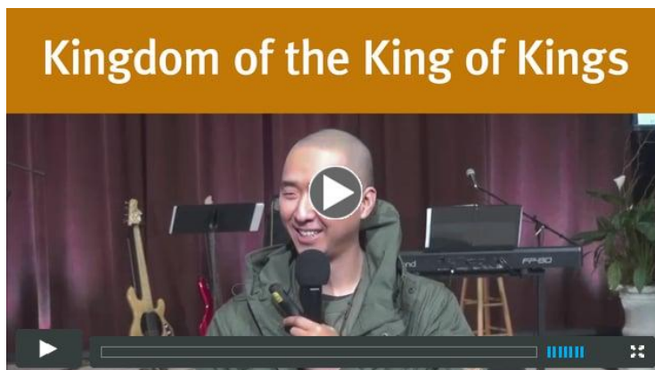
Kingdom of the King of Kings - March 5, 2017 Sanctuary Service

C.S. Lewis said that Jesus was either a liar, a lunatic or the Lord.