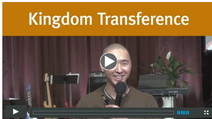
Kingdom Transference - Feb. 26, 2017 Sanctuary Service

This is nothing new. During the times of the Roman empire described in the book of Acts, the inhabitants of Lystra worshipped and sacrificed to Zeus, the exploitative, immoral mythical "god," rather than the real God who created the universe. Centuries before, the Greek philosopher Plato advocated that the "enlightened" state raise all children rather than the natural parents who gave birth to them.