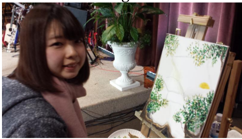
Praise painting by Mami Yamane based on Psalms 71:20-21

Our first calling is to be born as a boy or a girl with the task of accepting our responsibility to become a mature man or woman. Yet the satanic culture wants to undermine even this fundamental identity, beginning with indoctrination in government elementary schools where children are taught that they can choose their "gender identity" and continuing with "safe" free sex education that sabotages faithful marriages and responsible, powerful parenthood. If they can confuse youth into