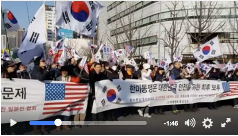
Feb. 18 Demonstration in Seoul, Korea