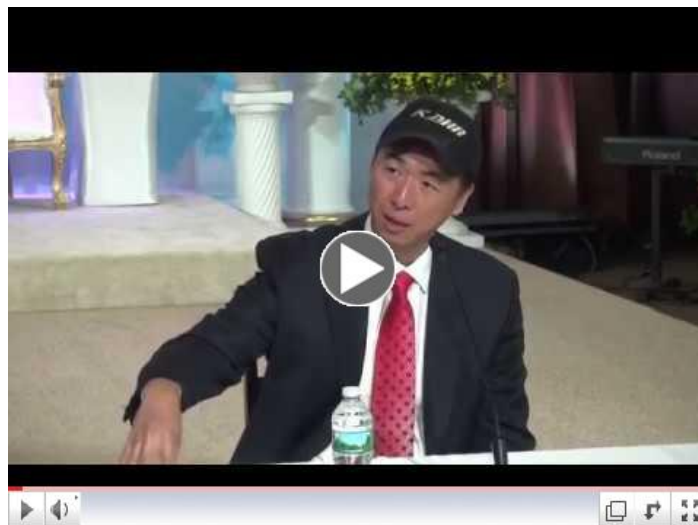
Are Jesus Christ and True Father the same spirit?