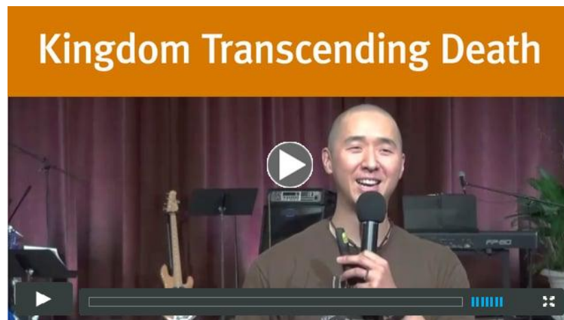
"Kingdom Transcending Death" Sanctuary Service - Feb. 12, 2017

Many of the Jewish religious leaders of the day feared doing anything to offend their Roman government occupiers. In this context, Jesus' powerful gospel of the kingdom caused anxiety among the Roman rulers and especially for the religious leaders who collaborated with them.