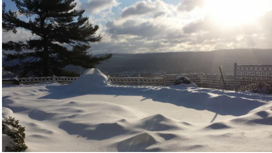
Winter at Cheon Il Goong Palace

In the first book, O Theophilus, I have dealt with all that Jesus began to do and teach, until the day when he was taken up, after he had given commandment through the Holy Spirit to the apostles whom he had chosen. To them he presented himself alive after his passion by many proofs, appearing to them during forty days, and speaking of the kingdom of God. Acts 1:1-3