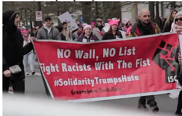
Anti-Trump Marchers call for fighting racism "with the fist."

Former Vice President Joe Biden lamented the risk of the "liberal international order" collapsing at the World Economic Forum in Davos, Switzerland. Such a decline would offer an opportunity to reestablish natural rights based on personal freedom and responsibility and based on sovereign citizens ready to defend their families and communities.