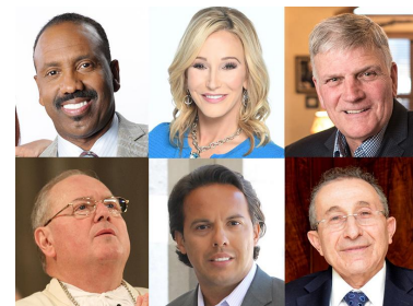
6 faith leaders prayed at Donald Trump's inauguration.

Before Trump spoke, six religious leaders offered prayers to God for the nation, more than any other president in history. He spoke about transferring power not to one political party, but back to the American people.