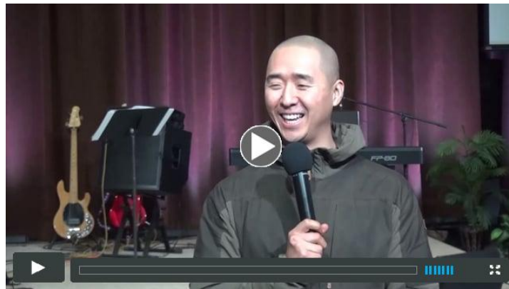
The Kingdom Born Again - Jan. 22, 2017 Sanctuary Service