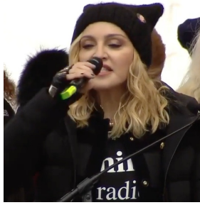
Madonna: "I have often thought of blowing up the White House."

and birth control as well as "immigrant and refugee rights regardless of status (legal or illegal) or country of origin."