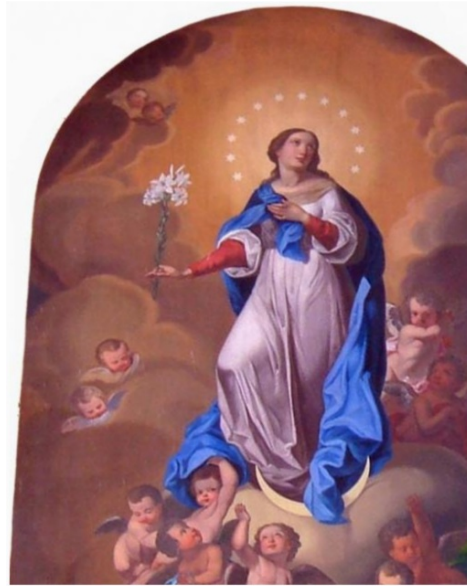
Fig 8. Mary as the goddess Selene, with the Moon beneath her feet and the twelve stars of the constellations around her head. This image is from the Mary Magdalene church in Gornji Grad, Slovenia, which indicates that the famous imagery from Revelations 12:1 can refer to Mary Magdalene as much as Mary

Ritual sacrifices in pagan cultures included offerings to a "fertility goddess." The uplifting of such "goddesses" who "sleep around" such as Aphrodite, Yelama, Ashtera and Diana/Artemis, the moon goddess, who was a "perpetual virgin" despite her behavior.