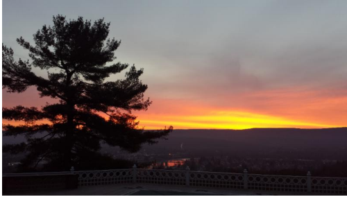
Sunrise at Cheon Il Goong Palace

Listen to me in silence, O coastlands; let the peoples renew their strength; let them approach, then let them speak; let us together draw near for judgment. Who stirred up one from the east whom victory meets at every step? He gives up nations before him, so that he tramples kings under foot; he makes them like dust with his sword, like driven stubble with his bow. Isaiah 41: 1-2