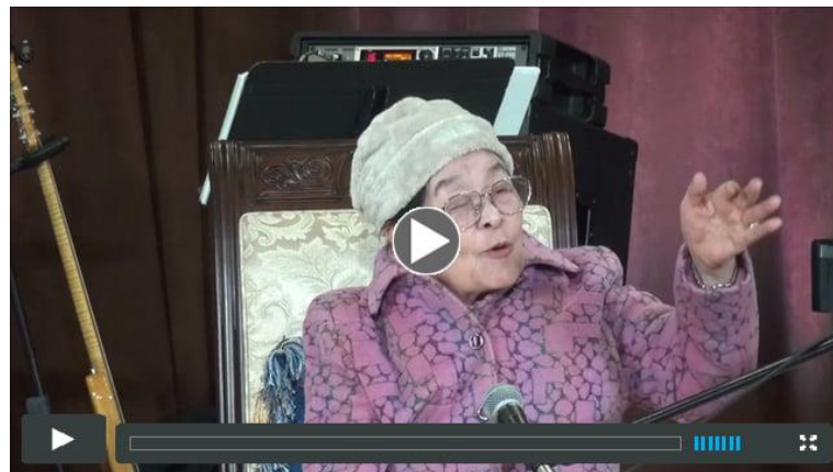
Sanctuary Church Sunday Service, January 8th, 2017