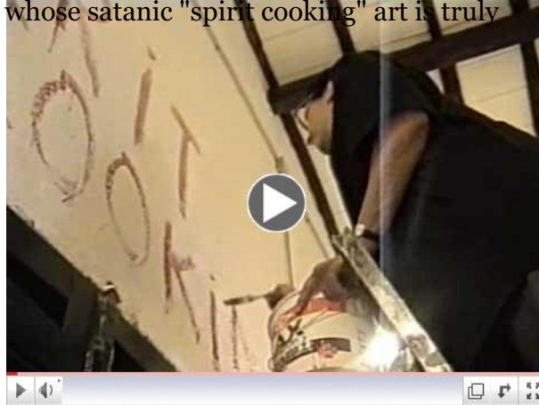
"Spirit Cooking" by Marina Abramovic

The mainstream media ridiculed reports about the ties of Hilary Clinton's presidential campaign chairman John Podesta and his brother Tony Podesta to Marina Abramovic, a "performance artist" whose satanic "spirit cooking" art is truly