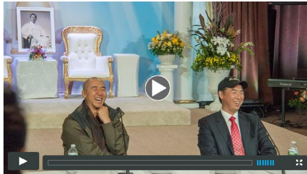
Q & A Session with Hyung Jin Moon & Kook Jin Moon - Oct. 31, 2016