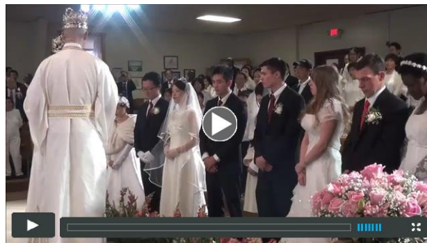
Holy Blessing Ceremony, October 30, 2016

He showed a video of True Father explaining that "a child born in the womb can die. When it does, it will go to the spiritual world, hidden from the parents' (father and mother) sight and pull them back into the fog wherever they try to go. You have gotten the equation wrong. Aborting and terminating does not help your spiritual journey...The spirits of those children who have died do not disappear. They have been born originating from eternal life. Those children have tried to build a pillar of love in the embrace of their father and mother for receiving life. They will condemn the mother for being killed."