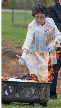
Burning Ancestral Liberation papers

The Cheon Il Guk constitution is based on the principles of freedom and responsibility. In the coming election, the American people have a choice as to whether judgment will come to the entire population or be limited to the government itself.