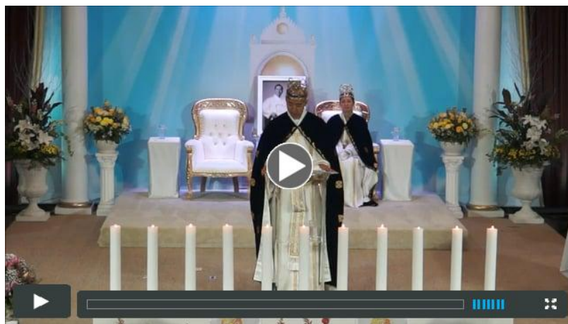
Ancestor Liberation and Blessing Ceremony, October 30, 2016