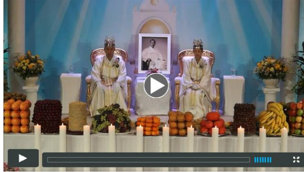
57th True Children's Day, October 31, 2016