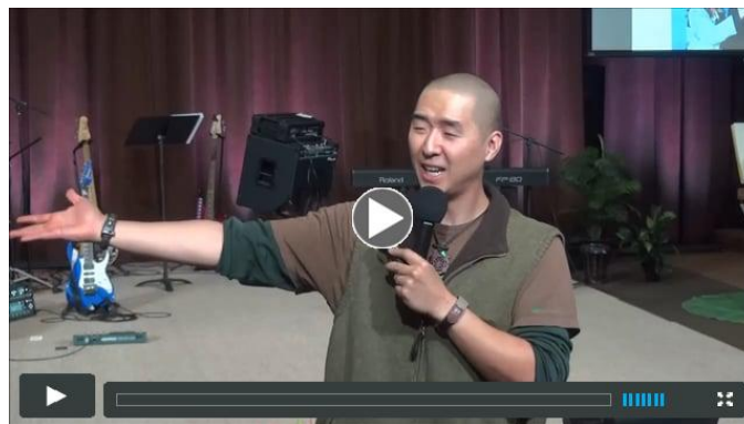
Kingdom Reversal - Oct. 16, 2016 - Rev. Hyung Jin Moon

In a nation based on free enterprise, if I don't act morally, people will not trust or want to do business with me, but in a corrupt nation, people succeed by manipulating government decisions. People in poor countries often suffer not because of a lack of national resources, but because of the political system, corruption and control mechanisms in those countries.