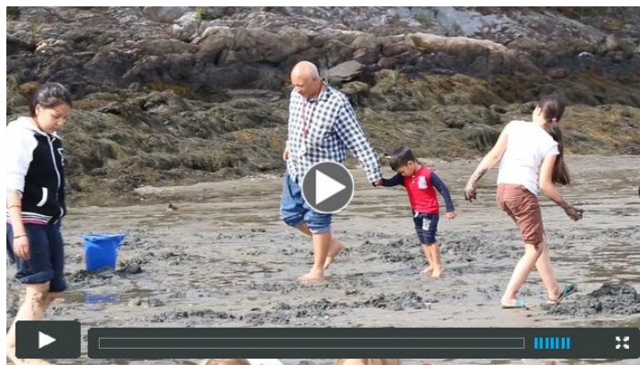
Digging Deeper at Sagadahoc Bay!