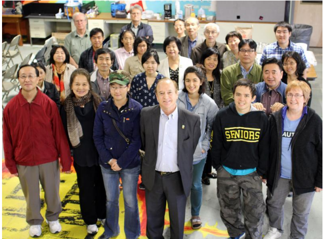
Sanctuary Worship in Worcester, MA

that men work in more dangerous jobs, the reason for the difference makes sense. 93% of occupational deaths in the U.S. happen to men. All 343 firefighters who died in the 9/11 attacks were.....men.