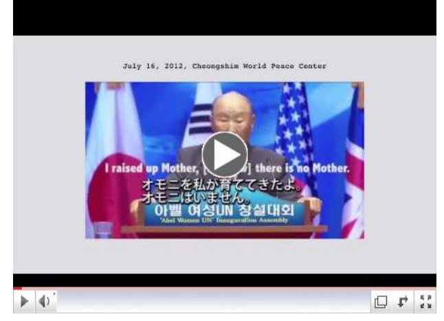
New Video: WHAT did Father Say???!!!!