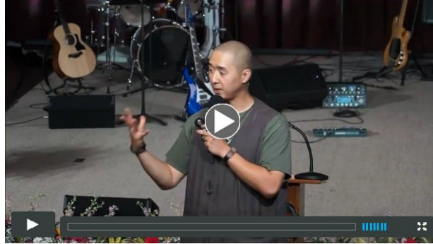
Sanctuary Sunday Service, August 21st, 2016