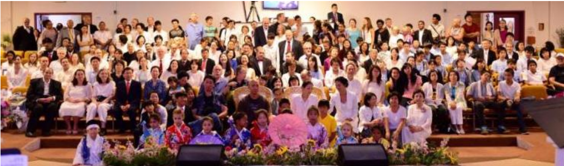
August 19 Holy Blessing in Newfoundland, PA

I reported that there are 24 Sanctuary state chapters at more than 30 different cities in the U.S. and two province chapters in Canada.