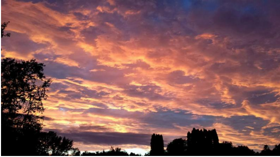
Newfoundland Sunset, August 21, 2016

Who is going to change the blood lineage? Not just anyone can do that. You must know that in order to do this work, I walked the way of the tearful cross...He did not have to face the way of death. If he had the family foundation and children, Christianity would have been different today. The world would have been ruled through Jesus' direct lineage. Blessing and Ideal Family Chapter Three, Part 2, REBIRTH AND THE ORIGIN OF THE BLESSING