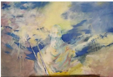
Praise Painting based on Book of Noah by Kimiyo Takeuchi

Evangelist Ray Comfort gives the example of someone paying "your $25,000 fine." Modern converts don't understand they break God's law every single day. People imagine that a merciful God would ignore their sins, but if a worldly judge has to follow the law, why would God not have to follow his heavenly law even more?