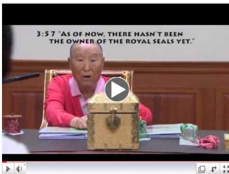
2012:07:24 HDH- God of Night and God of Day still fighting

Previous questions the Family Federation has not yet answered: