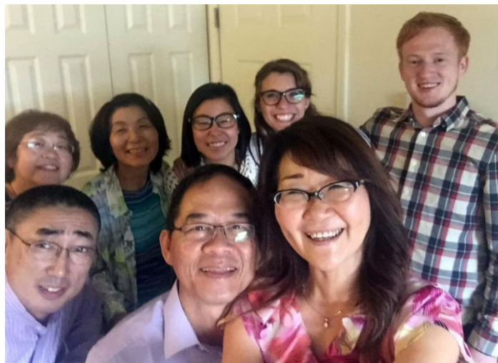
Chicago Sanctuary Service Worshippers