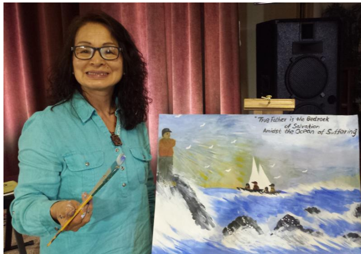
Miho Panzer Praise Painting based on 2016 Motto "True Father is the Bedrock of Salvation Amidst the Ocean of Suffering"