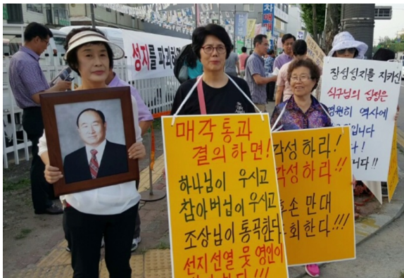
Demonstrators protesting Kuri Property Sale