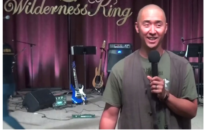
"Kingdom Order" Sermon 7/31/2016