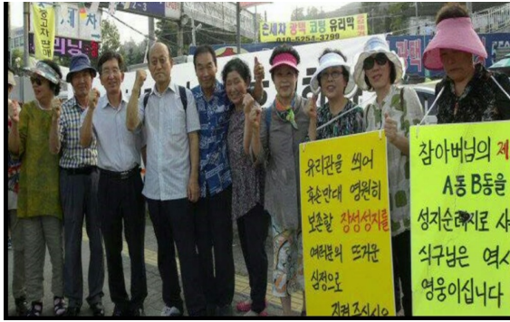
Demonstrators protesting Kuri Property Sale

what she has done." You cannot love good, and tolerate evil. Even when Father was in the hospital, the Family Fed had already created committees to change his words and legacies.