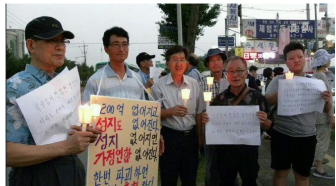
Demonstrators protesting Kuri Property Sale

U.S. President Lyndon Baines Johnson said about minorities, "we'll give them a little, but not enough to make a difference." The welfare system rewards women, but only if they do not have a married husband in the home. Impacts lower income families the most, but inevitably leads to poorer outcomes for the fatherless children.