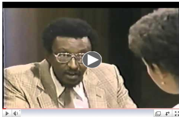
Walter Williams: The State Against Blacks

"Compassionate" laws like a federal minimum wage and a plethora of government regulations to "protect" the consumer often end up INCREASING minority unemployment by raising the costs and barriers for entering the workforce, as explained by economist Walter Williams.