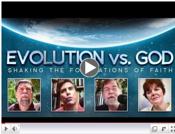
Evolution vs. God documentary

state socialism. Get people away from God. And from parents' values. Japanese claimed to be most evolved because of less body hair. Germans claimed that the "Nordic race" was superior because of blond hair. Such justifications were invoked to eliminate "inferior" races.