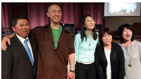
Group visiting Newfoundland from Kumamoto, Japan

After the two earthquakes, many in the congregation moved in to live together. They felt that "Father is living with us."