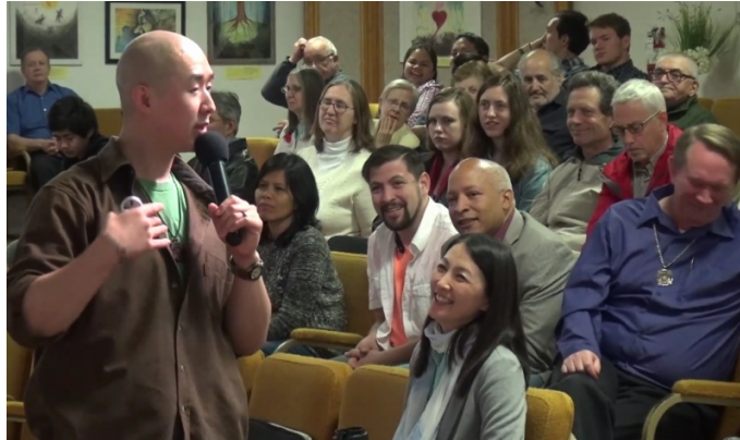
"The Kingdom Nature" May 22, 2016 Sermon