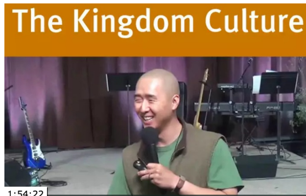
May 1, 2016 Sanctuary Sermon