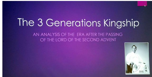
Overview of Era after Passing of Lord of the 2nd Advent

Jesus spoke about the upside-down kingdom. Loving your enemy makes no sense in a socialist system, which is based on envy, class hatred and the class warfare that Marx called for. In a free enterprise system you have competition, which brings out the strongest and the best in you. In a truly free market, you love your opponents and competitors because they force you to make better products to serve your customers better. In a socialist system, government connections are more important than providing good service.