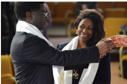
Holy Blessing Ceremony

People came to America to seek religious and political freedom in the 17th and 18th century. They created a nation which has a constitution, from which laws are created which should protect the rights of citizens so that they can pursue prosperity through self-reliance and hard work. On that basis, America could become the most prosperous nation in the world.