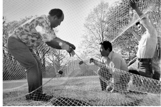
Father making fishing nets at Barrytown

My older brother whom I'm closest to could not understand. He threw my Divine Principle and Bible in the fire, but they would not burn. My father took