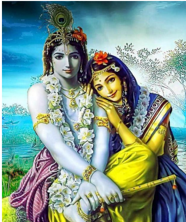
Krishna & Radha

feminine anything new, as evidenced by the thousands-of-years-old divine couple, Krishna and Radha (shown to the left).