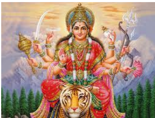
Hindu Goddess Durga