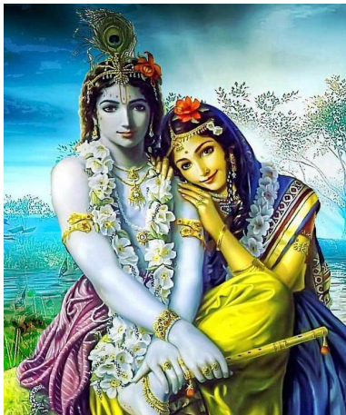
Krishna & Radha

feminine anything new, as evidenced by the thousands-of-years-old divine couple, Krishna and Radha (shown to the left).