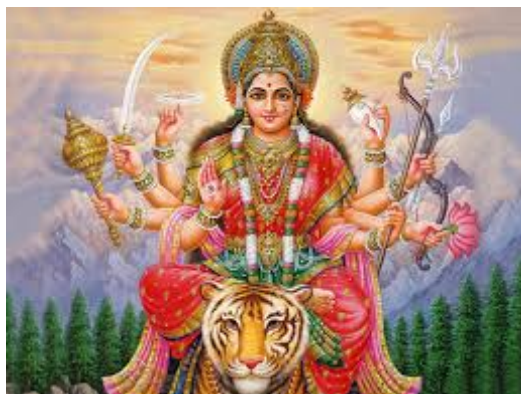
Hindu Goddess Durga