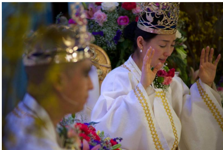
Celebration of True Father's 96th Birthday