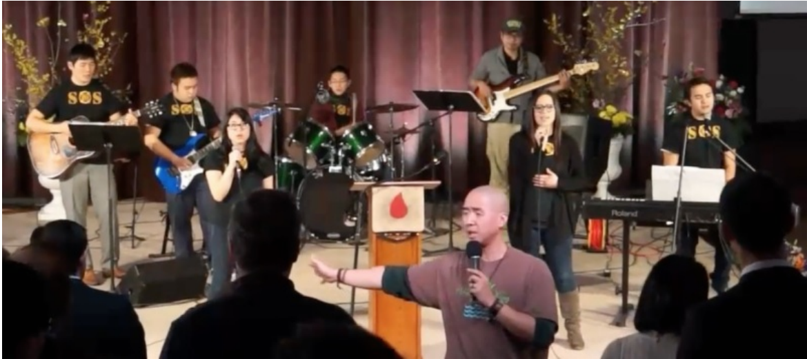
2/14/2016 Unification Sanctuary Worship Service