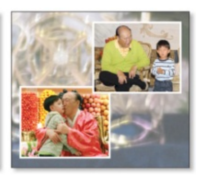
Order the Unification Sanctuary 2016 Calendar